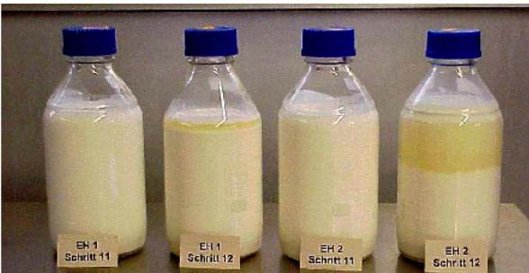
Fig. 2: After 5 weeks of storage; from the left to the right: UHT direct (EH1): 5°C, 25°C and UHT indirect (EH2) 5°C, 25°C

Sedimentation of protein is the main problem of UHT preserved camel's milk. In contrast to cow's milk camel's milk proteins are much more heat sensitive. Sediment formation occurred with both UHT processing methods (direct and indirect heating) stored at 25°C. Direct UHT together with refrigeration resulted in a mostly stable product. Analysis at weekly intervals during a period of 5 weeks showed little and reversible sedimentation only. However despite of very mild process conditions stability was still unsatisfactory.